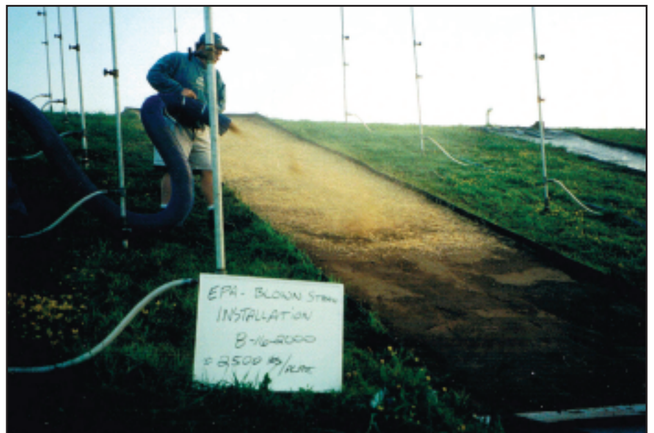
Blown straw installed for testing.

In the case of RECPs, a very rigorous series of evaluations has been developed and implemented. Testing and research that the RECP industry utilizes has proven to be a major catalyst in the overall increase in confidence and use of the technology. Detailed testing has been