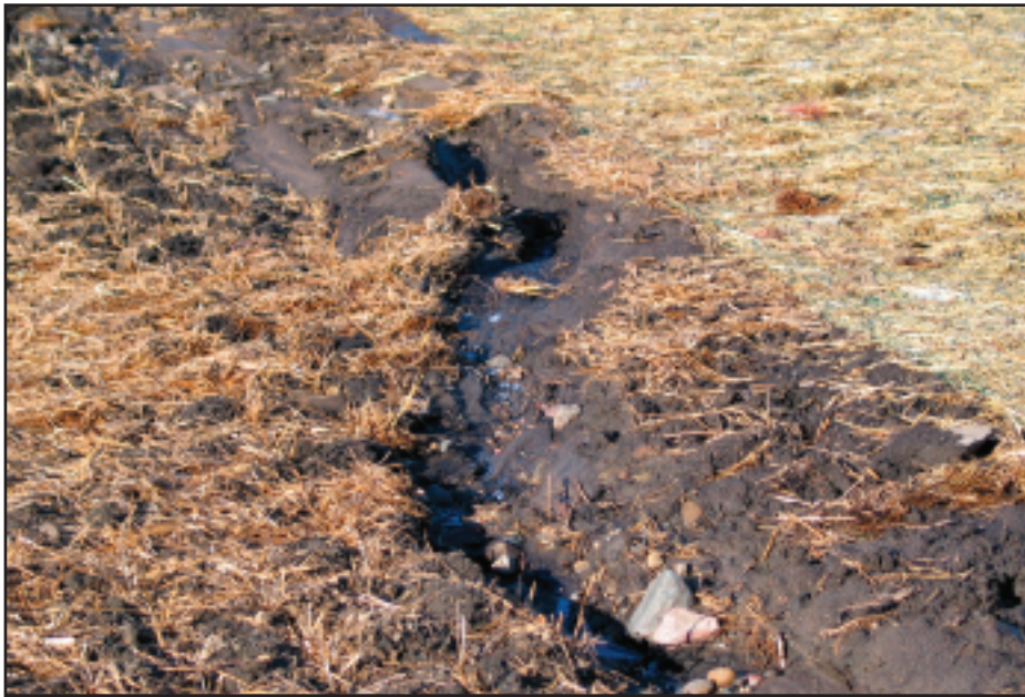
Rill erosion and blown straw.

slopes, and no measurable benefit on clay soil. Blown Straw showed an overall lack of utility on slopes without the potential to freely drain, which was contradictory to other work. Typically, Blown Straw is specified as a very effective erosion control practice. In testing Blown Straw by more rigorous methodologies, the thresholds of performance for Blown Straw become apparent. Comparing the results from testing of the two methodologies, it becomes evident that the field usefulness of Blown Straw is restricted to shallow slope, low risk environments. Applied to steeper slopes and exposed to significant rainfall and runoff, Blown Straw provides minimal benefit as an erosion control practice.